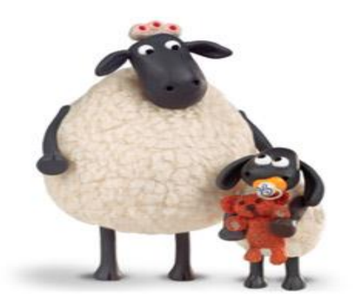
Proudly sponsored by